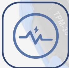
Resolution 0.01 dB