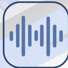
7 Wavelengths detection