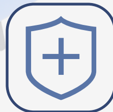
Silicone protective jacket