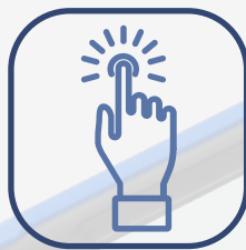
One key start