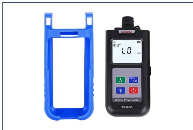
Split protective jacket